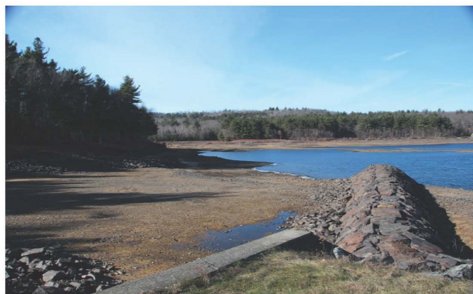
These photos compare the water level in a reservoir in Worcester, Massachusetts, with the one at the right showing the impact of the 2016 drought.